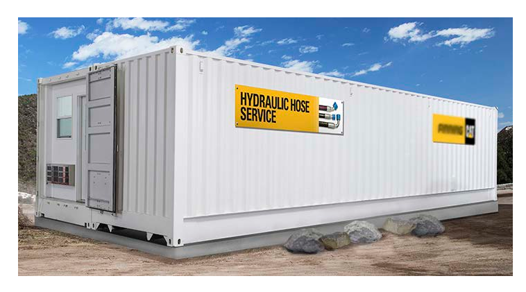
Every Cat Hose Assembly Mobile Workshop is sealed from outdoor contaminants and features durable, high-density cabinets and other storage solutions designed for clean, efficient storage of parts and tooling.

When a hose failure occurs at a remote location, you expect a quick, reliable repair. A Cat Hose Assembly Mobile Workshop—engineered and stocked to support your machine population—provides the immediate support you need, exactly where you need it. This minimizes your downtime by ensuring that any hose failure can be addressed immediately so your machine is quickly back in operation.